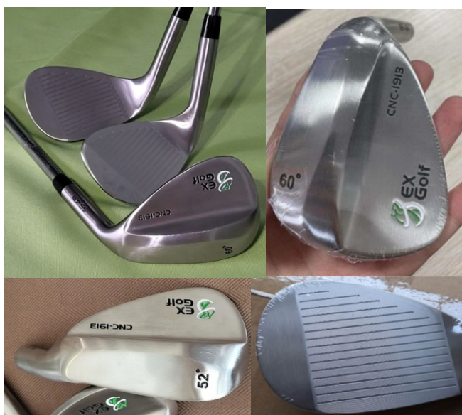
CNC 1913 Wedge Specifications

Try a matched set of wedges made only for your short game and less than full shots, not built for full shots. You'll be amazed at how much your short game will improve.